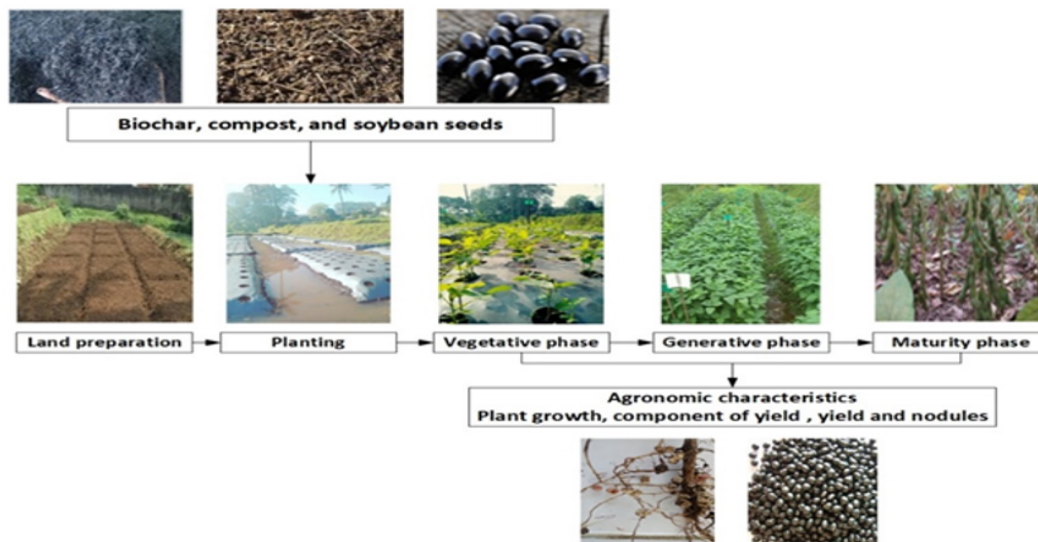
Figure 01: Flowchart of research

Data were analyzed using ANOVA and DRMT/ Duncan's tests at the level of 5%. The experiment was carried out on moor fields with 125 cm x 200 cm plot size of 30 plots (one plot consisted of 25 plants). plants per treatment plot with a spacing of 25 cm x 40 cm. Compost and biochar applications are carried out when planting by mixing the two ingredients then put into the planting hole, then filled with 2 seeds. Application of N, P, K fertilizer is given from the age of 14 DAP/ Days. After Planting, Fertilizer N is given twice (each half dose at the age of 14 DAP and 35 DAP), Fertilizer P and K are given all doses at age 15 DAP. The measured parameters are the characteristics of growth, nodules, component yield and yields. The flowchart of research is shown in Figure 01.